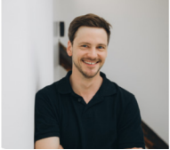
Daniel Reinhard Jäger

Introduction: This work explores the implementation of machine learning models in the Beckhoff TwinCAT control software. Utilizing a small dataset, synthetic data is generated to simulate phenomena that were not originally recorded in order to implement loss detection in the Beckhoff XTS transportation system.