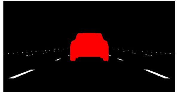
An example of the positive and negative rewards received by the follower car in a vehicle platooning scenario. Own presentation