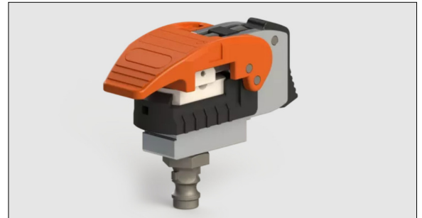
Tactile measurement: Along the direction of the yarn flow in the channel of a nozzleplate Own presentation

Final product: "SlideJet-FT15-2" from Heberlein with an integrated nozzleplate www.heberlein.com